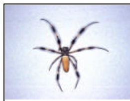
Female Banana Spider

commonly known as the Golden Orb Weaver or the Golden Silk Spider ( Nephila clavipes ).